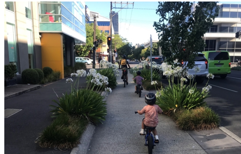
Frome Street - before and after